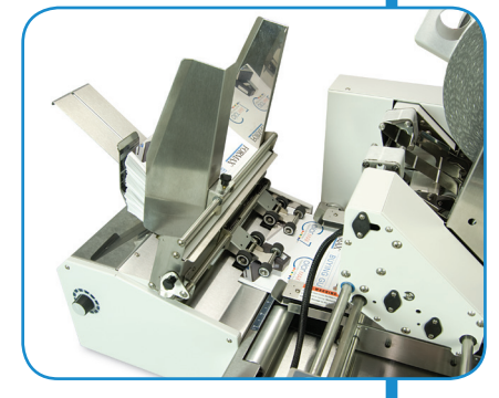
FD 282-05 Medium Duty Synchronized Feeder