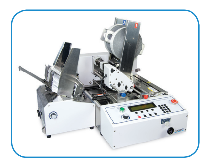
FD 282SF - FD 282 Tabber plus Medium Volume Synchronized Feeder