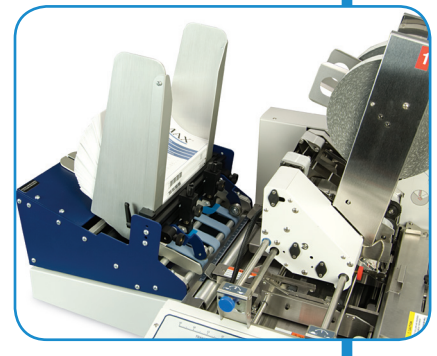
FD 282-10 Heavy Duty Friction Feeder