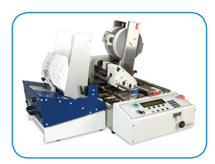
FD 282HF - FD 282 Tabber plus High Volume Heavy-Duty Friction Feeder