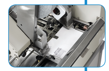
Edge tabbing both sides of a mailpiece simultaneously