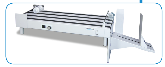
FD 282-30 Drop Stacking Conveyor

Formax - New Hampshire, USA www.formax.com