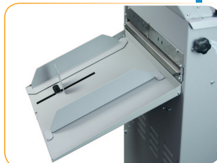
Perforation / score attachment, included

Formax - New Hampshire, USA www.formax.com