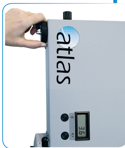
Fold adjustment knob and LCD readout