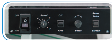
Easy-to-use control panel